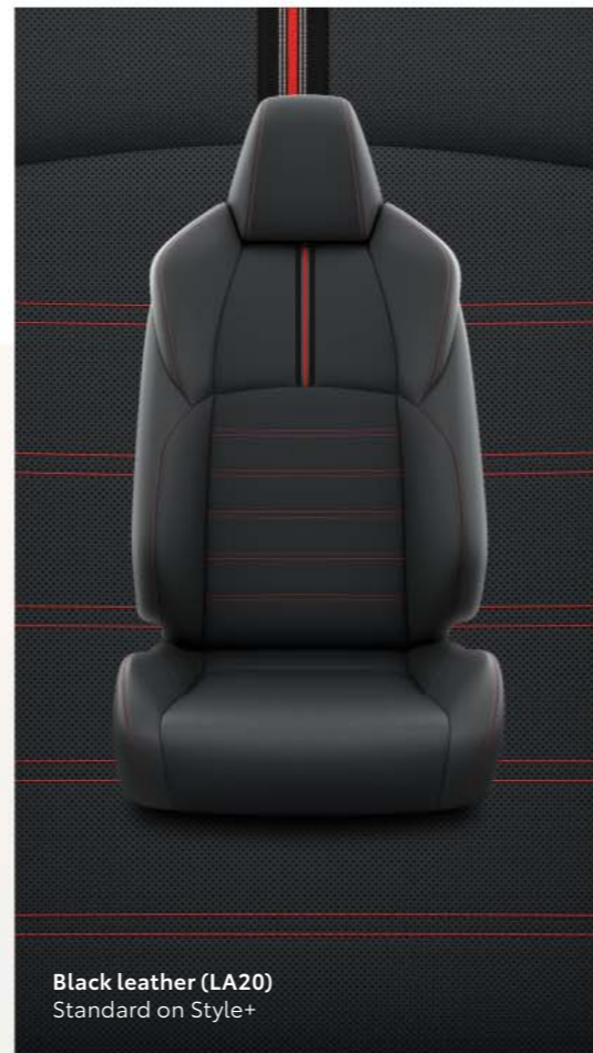
Black leather (LA20) Standard on Style+