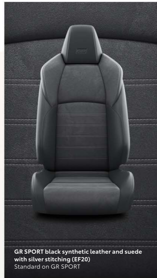
GR SPORT black synthetic leather and suede with silver stitching (EF20) Standard on GR SPORT