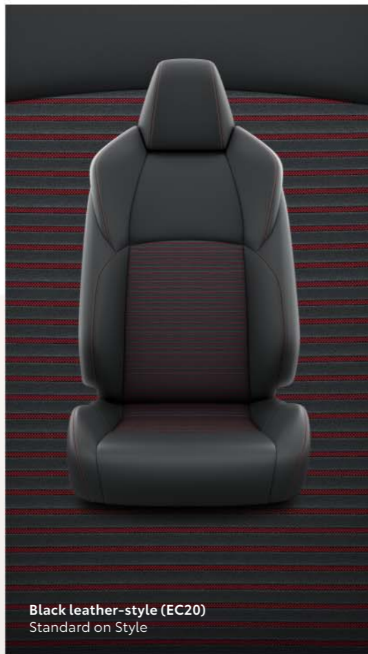
Black leather-style (EC20) Standard on Style

Complete your look with a choice of head-turning 18" or 19" machined-face alloy wheels. Inside the new RAV4 Plug-in Hybrid, black trim options range from leather-style to genuine leather with contrasting red stitching, to add an extra touch of sportiness.