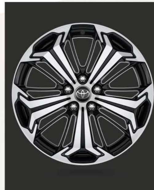
19" black machined-face alloy wheels (5-spoke) Standard on Style, Style+