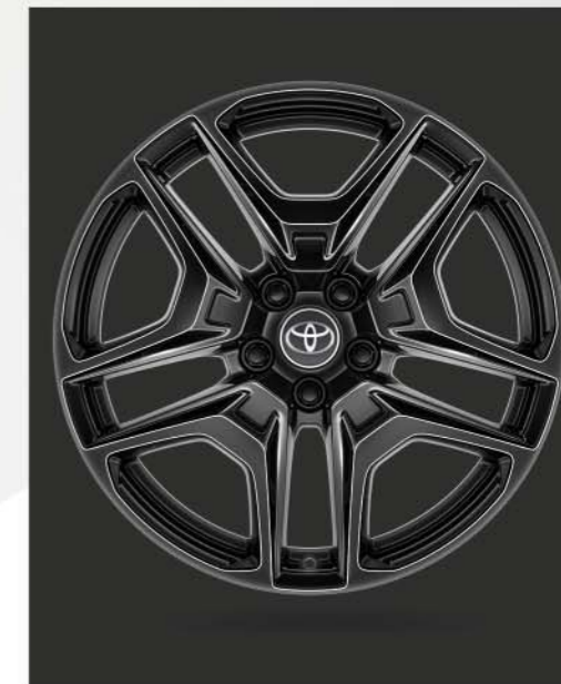
19" GR SPORT glossy black alloy wheels with fine line cutting (5-double-spoke) Standard on GR SPORT